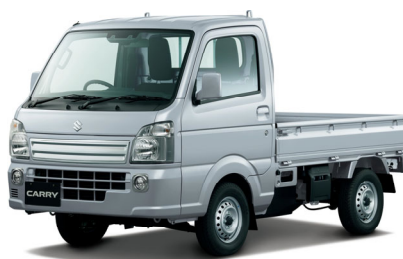
CARRY KX with stereo camera mounted