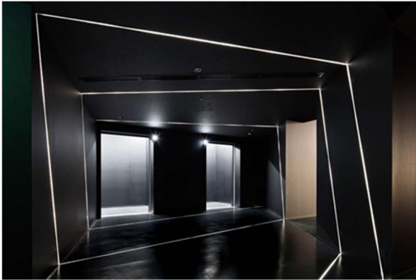
Shuttle elevators installed on the observation facilities "SHIBUYA SKY"