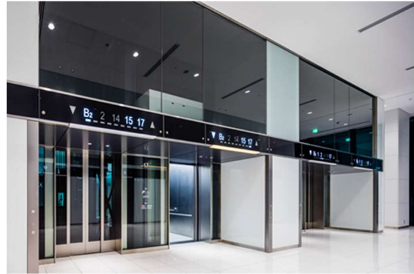
High-speed and large capacity elevators installed on the office area