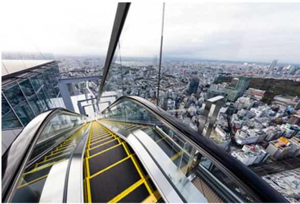
Outdoor-type escalator installed on the observation facilities "SHIBUYA SKY"