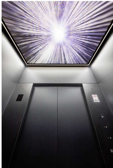
Shuttle elevator installed on the observation facilities "SHIBUYA SKY"