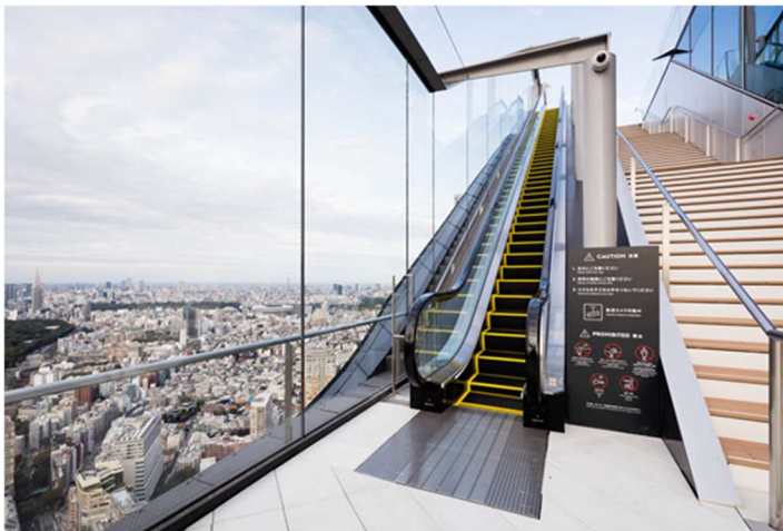
Outdoor-type escalator installed on the observation facilities "SHIBUYA SKY"