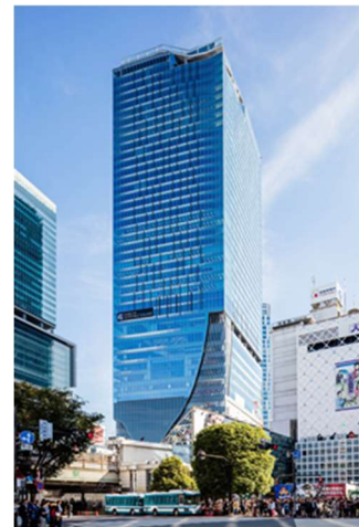
External view of Shibuya Scramble Square

Tokyo, October 28, 2019 --- Hitachi, Ltd. (TSE: 6501 / "Hitachi") and Hitachi Building Systems Co., Ltd. ("Hitachi Building Systems") have delivered 76 units of elevators and escalators, including outdoor-type escalators installed at the highest spot in Japan (1) , 230 meters above ground, to Shibuya Scramble Square, a large-scale complex building in Shibuya, Tokyo, that will commence operation on November 1.