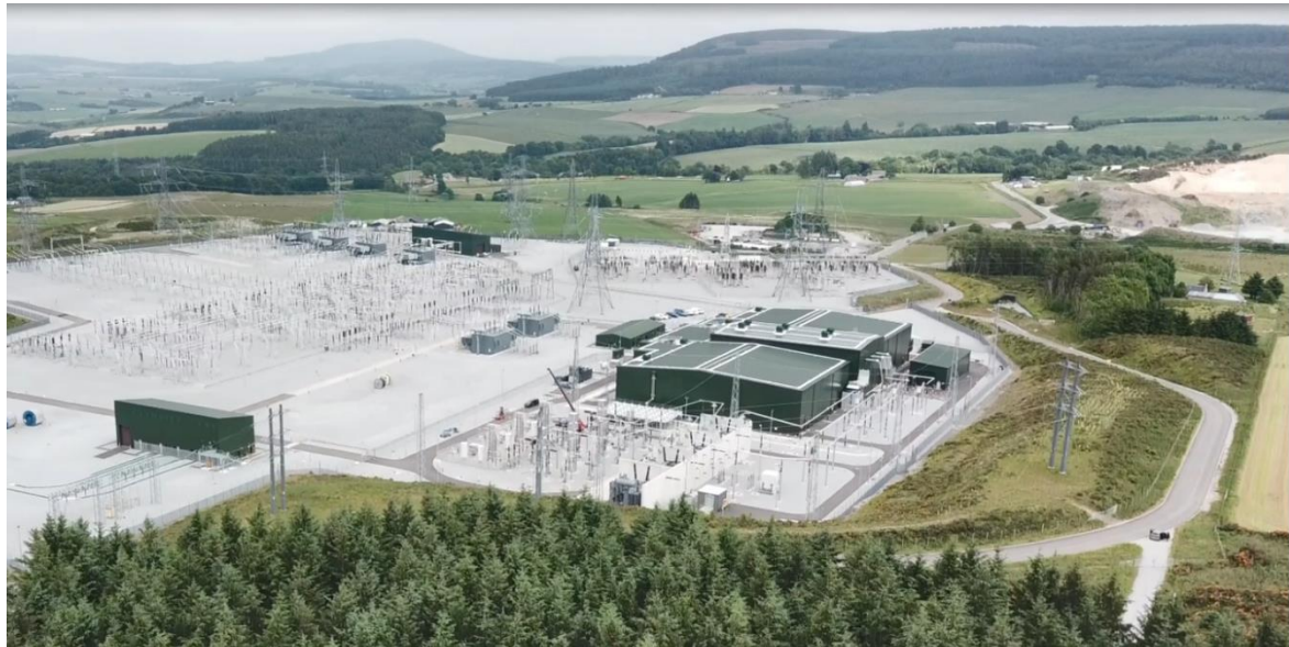
The HVDC converter station at Blackhillock, Scotland, one of the two stations in the Caithness Moray Link

Five large HVDC systems in Scotland will transmit wind power to the south, playing a key role in the UK's energy transition