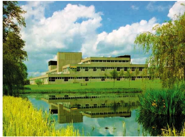
Fig. 2—Cambridge University Cavendish Laboratory. Over the years, the Cavendish Laboratory of the University of Cambridge has turned out many Nobel Prize winners in the field of physics. Within that laboratory, Hitachi's Cambridge Laboratory is pursuing joint research on fields (such as spintronics and quantum information processing) concerned with cutting-edge devices.

In the meantime, in China, the country's excellent human resources are utilized fully, and to perform