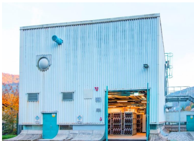
The storage batteries which were installed in the power distribution grid in the Idrija district

Based on the analysis and evaluation results of the demonstration project, we will consider the development of the business model in the form of a service, primarily in Europe, that provides cloud-based AEMS along with cloud-based DMS (completed in 2019). Along with the start of this demonstration operation, an online ceremony to celebrate the start of operation was held connecting Slovenia with Tokyo, which involved parties attended from both countries.