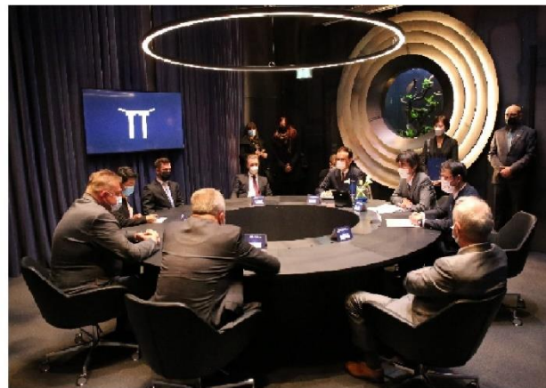
The online ceremony to celebrate the start of operation