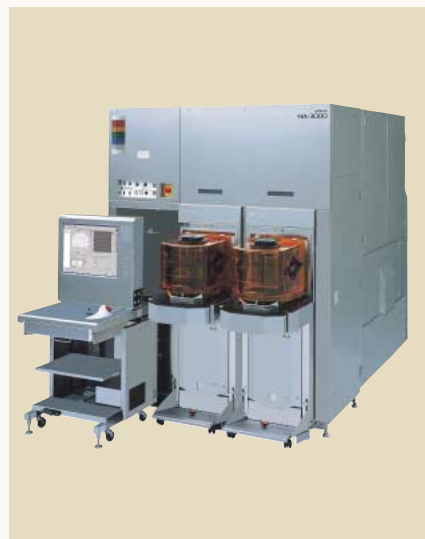
HA-3000 co-developed by Tokyo Seimitsu Co., Ltd. and Hitachi High-Technologies Corp.

wavelength, resolution is markedly enhanced thus permitting the detection of minute defects that until now would be overlooked. A problem with such high resolution is that it fails to differentiate fatal defects from nuisance defects that don't affect device performance. To address this