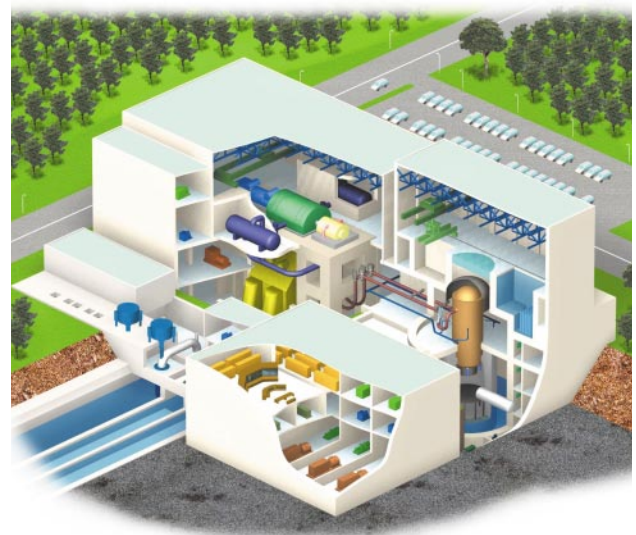
Fig. 1—Cutaway View of Hitachi's ABWR.

water reactor) with medium scale power output of about 650 MWe shown schematically in Fig. 1, as a solution tailored to meet these varying needs of the global market. This paper presents an overview of