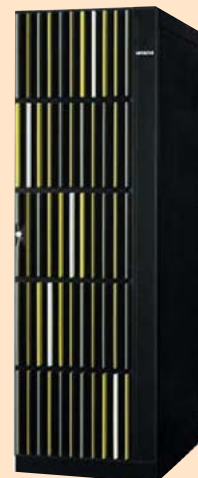
Hitachi's enterprise blade system