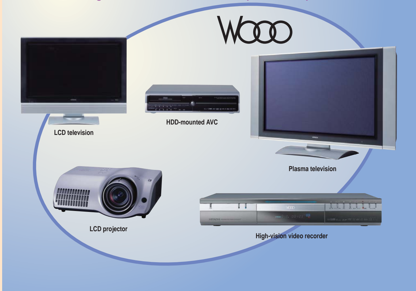
Device lineup for high-vision

Utilizing core technology from its digital electrical appliances, Hitachi's new high-definition FPD television lineup was developed.