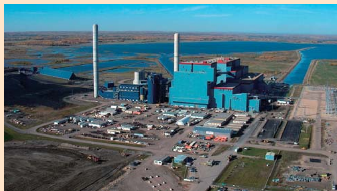
Genesee supercritical-pressure power generation plant (Canada)

In regards to expanding our business overseas, since the key to success will be obtaining as much on-site information as possible, directly talking with customers, and speeding up our responses, it is important to develop and strengthen our bases in the field. Accordingly, in the case of supercritical-pressure power generation plants, as our North American base, Hitachi America, Ltd. is continuing to improve our system for accepting orders regarding EPC projects. Starting with the USA, countries around the world will continue to demand more power in the future.