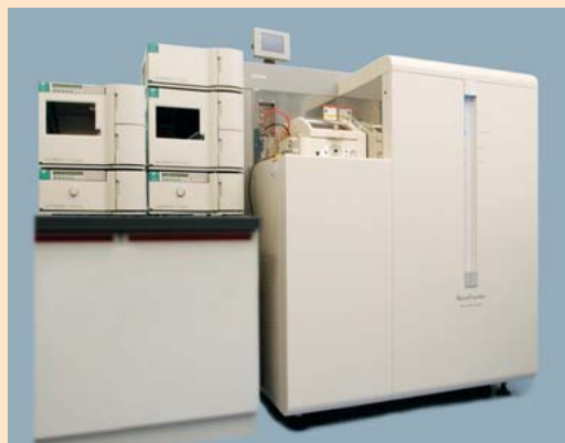
Mass spectrometer with highly-sensitive multiple fragmentation capability with 5-ppm mass accuracy (right); Nano-flow chromatograph for handling minute flow volumes of liquid, namely, 50-nano-liter per minute (i.e. 50 billionths of a liter per minute)

Disease-related proteins are often minute in quantity and complex in structure. Their structure can be changed by cellular chemical reactions, which result in “modified proteins.” To analyze such proteins, a mass-spectrometric technology called “linear ion trap” is widely used recently, because it offers 10 times higher sensitivity