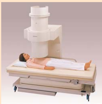
Hitachi MC-6400 Magnetocardiograph system (manufactured by Hitachi High-Technologies Corporation)

Magnetic field characteristics that are measured using MCG are different from the heart activity characteristics currently captured by ECG from the body surface. MCG is not influenced by body tissue like blood, bone, or fat, so it can capture the location of cardioelectric phenomena with a very high degree of precision. MCG, unlike ECG, can also detect angina pectoris condition. Early detection of angina pectoris makes it possible to initiate treatment to prevent myocardial infarction. MCG can also detect where ischemia is occurring in the heart.