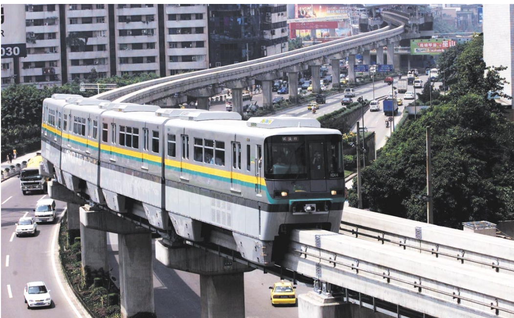
Fig. 1—The 1000-series Monorail Train Delivered by Hitachi and in Operation in Chongqing City Center.

Chinese government. In a municipal area covering 82,400 km 2 with a population of 32 million people, the urban area of Chongqing City covers 315 km 2 with a population of 3.3 million people. As regards public transportation in the Chongqing urban area—consisting of trolley busses, buses, taxis, etc.—it has