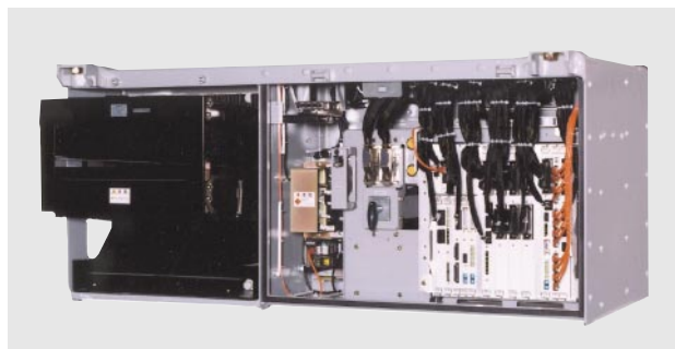
Fig. 4—External View of VVVF Traction Inverter. A pulse-length-modulation three-level inverter using an IGBT (insulated-gate bipolar transistor) for the semiconductor circuit elements is utilized. By using vector control for finely controlling torque for each bogie, ride quality and track adhesion performance are improved.

applied, and by using a correction value for carrier frequency at low speeds, generation of noise is suppressed.