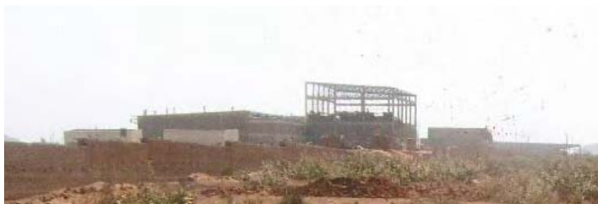
Fig. 2—Construction in Progress at Neemrana Industrial Park in Delhi-Mumbai Industrial Corridor.