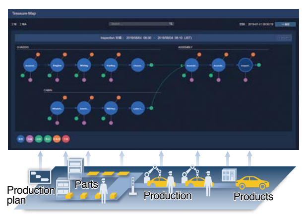
Conceptual diagram of the digital twin solution

One example of the application of Lumada at manufacturing workplace is our collaboration with the AMADA Group, a major metalworking machinery manufacturer. After delivering servo motors used in pressing machines, we constructed a tooling IoT production line by applying robotics in 2017. We also contributed to the improvement of productivity and operational efficiency in 2019, when we built Assembly Navigation System with the goal of upgrading manufacturing workplaces.