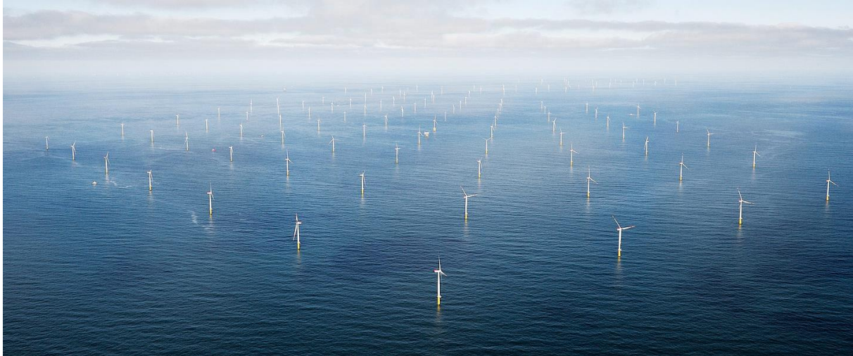
The Hornsea Two offshore windfarm

HVDC Light® transmission systems will connect the Hornsea 3 wind farm, providing renewable power for more than three million homes