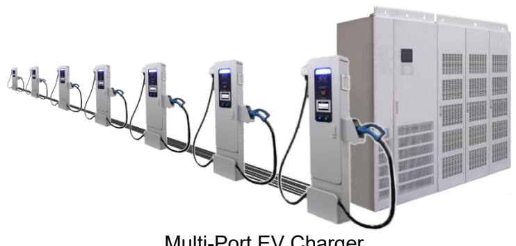
Multi-Port EV Charger

Hitachi Industrial Products to Launch High-capacity Multi-port EV Charger that Contributes to the Expansion of Charging Infrastructure and Growth of EVs towards the Realization of a Decarbonized Society