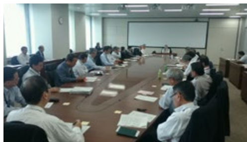
A scene from the officer training session.