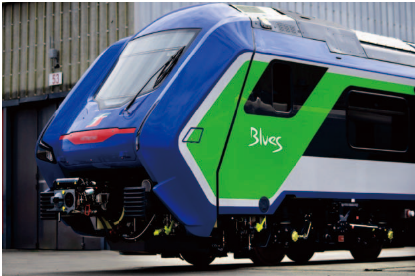
3 Masaccio single deck

Hitachi Fleet Management Tool (HFMT), one of the Lumada digital platform, is one of world first integrated solution developed in collaboration between partners in UK, Japan, and Italy and Hitachi Vantara LLC. HFMT is Hitachi Rail's strategic digital asset monitoring