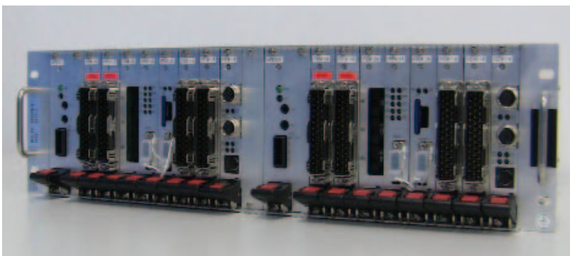
6 ETCS onboard equipment

The company plans to implement automatic train operation (ATO) over ETCS, which will operate in coordination with ETCS, and continue to contribute to the construction and development of railway infrastructure.