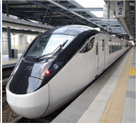
2 New intercity express train, EMU3000

operation on December 29, 2021. Since then, it has been in daily operation as an intercity express train running throughout Taiwan.