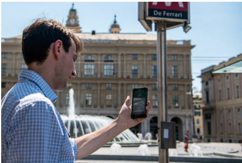
5 360Pass with Lumada Intelligent Mobility Management