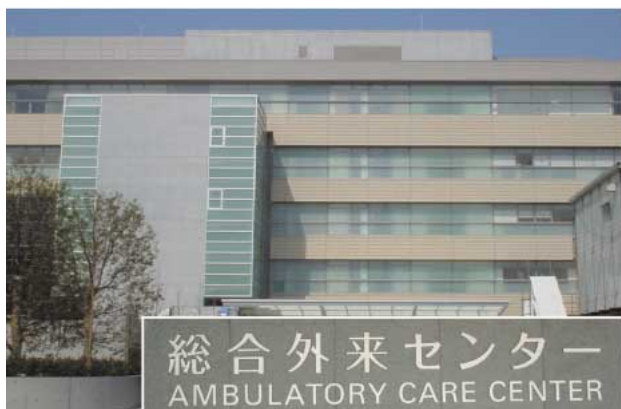
Fig. 3—Exterior of Tokyo Women's Medical University Ambulatory Care Center.

Opened in 2003, the state-of-the-art Ambulatory Care Center can accommodate up to 5,000 patients on an outpatient basis per day. The PET scanning equipment is installed in the basement.