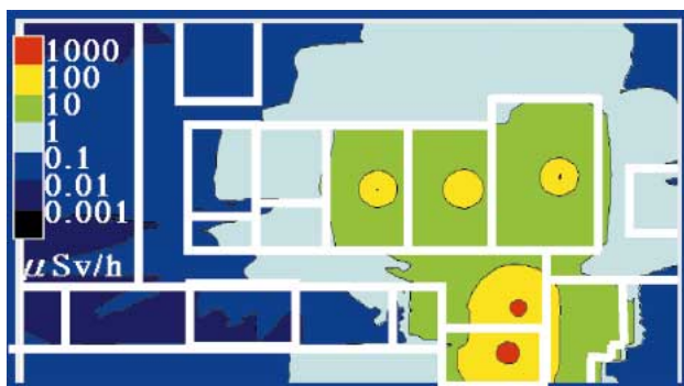
Fig. 4—Radiation Exposure Distribution in PET Facility Caused by Radiation from Patients.

Opened in 2003, the state-of-the-art Ambulatory Care Center can accommodate up to 5,000 patients on an outpatient basis per day. The PET scanning equipment is installed in the basement.