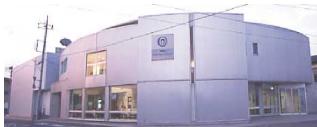
Fig. 5—PET Center at Utsunomiya Central Clinic.

Naturally, the university's primary concern was that the facility be designed and constructed to ensure that their medical personnel including doctors, radiologists,