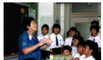
European and American teachers visiting Japan

This year marked the 15th anniversary of HISTEP, with 180 teachers having participated in the program so far.