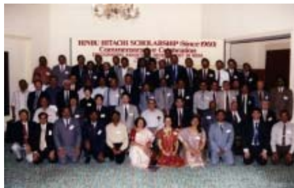
On February 3, 2001, Hindu-Hitachi trainees gathered to celebrate the 100 th completion of the scholarship.

The trainees go through language training during the first six weeks of the program, followed by the actual training in one of Hitachi's factories. The latter takes approximately four months. Training this year took place at the Hitachi Automotive Factory.