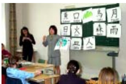
Japanese teachers' visit to Europe and US

This year in March, Japanese teachers departed for European and American destinations, and in June, European and North American teachers came to Japan.