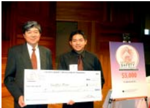
Scholarship awardee receiving his prize

米国カリフォルニア州で地域コミュニティの安全に寄与した高校生を表彰するプログラムで、サンディエゴ、ロスアンゼルス、サンフランシスコ地区から合計15名が受賞しました。