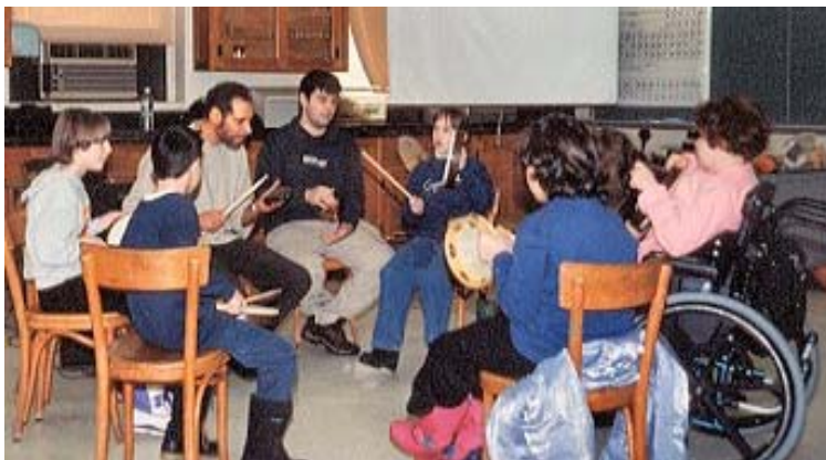
Music Therapy at Heartsong

*MFP: Matching Funds Program supported by The Hitachi Foundation 日立ファウンデーションが北米日立グループの地域貢献活動を支援するプログラム