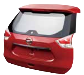
Hitachi Chemical's molded plastic rear door module

Hitachi draws on its wealth of technological expertise and know-how to provide a variety of materials and components—such as semiconductor- and display-related materials, synthetic resin products, specialty steels, magnetic materials, casting components, and wires and cables - that enable advanced functions in products for such sectors as autos, IT and consumer electronics, and industrial and social infrastructure. Business operations are focused in Asia, North America, and Europe.