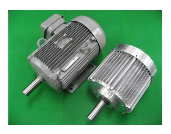
Fig. 3. Comparison of motor size

Left: Conventional industrial 11kW induction motor Right: New motor developed