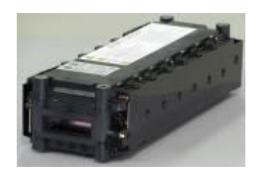
A lithium-ion battery module