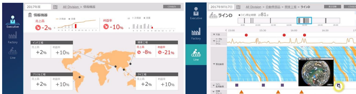
Screen example of the management and manufacturing dashboard (left side: screen of management dashboard, right side: screen of manufacturing dashboard)

Taking Full Advantage of 4M Data in Manufacturing Workplaces to Enable Prompt Decision-making