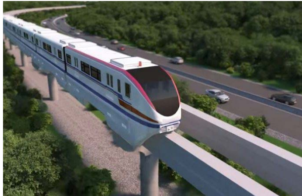
Image of a monorail system for Line 3 of Panama Metro

Panama City, August 30 th , 2018 – Hitachi, Ltd. (Hitachi), Ansaldo STS SpA (Ansaldo STS), a group company of Hitachi and Mitsubishi Corporation today announced that they have signed a memorandum of understanding with Metro de Panamá, S.A. (MPSA) to provide a monorail system for Line 3 of Panama Metro.