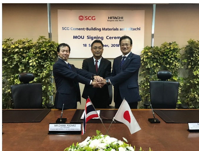
MOU Signing Ceremony

Bangkok, September 18, 2018 --- Hitachi, Ltd. (TSE: 6501, “Hitachi”), Hitachi Asia (Thailand) Co., Ltd. (“Hitachi Asia (Thailand)”) and SCG Cement-Building Materials Co., Ltd. (“SCG-CBM”) today announced the conclusion of a Memorandum of Understanding (“MOU”) concerning collaborative creation to promote energy saving across SCG-CBM factories and increase efficiency in dispatching process.