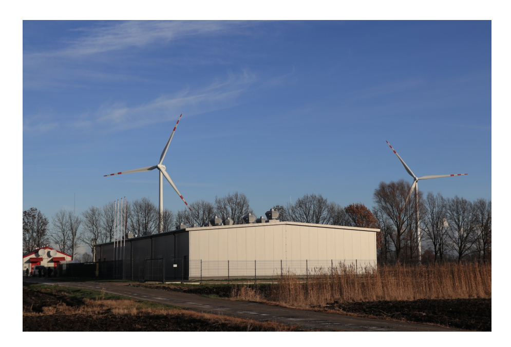
Figure 1. The hybrid BESS building installed next to the Bystra Wind Farm