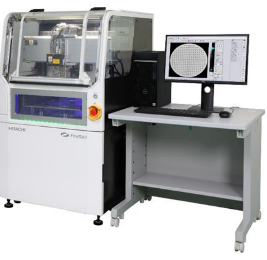
Scanning Acoustic Tomograph "FineSAT7"

Improving quality inspection accuracy of semiconductor devices, electronic components becoming finer and more multilayered, and large wafers