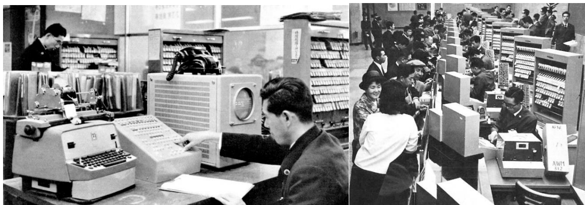
Figure 2. Seat reservation counter at the time of opening (Left: MARS-1 (Tokyo Station, 1960), Right: MARS-101 (Tokyo Station, 1965))