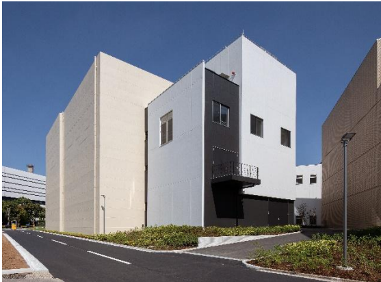
Exterior of the Proton Therapy Center

A consortium of four companies has developed the proton beam therapy facility and will support its operation for 20 years