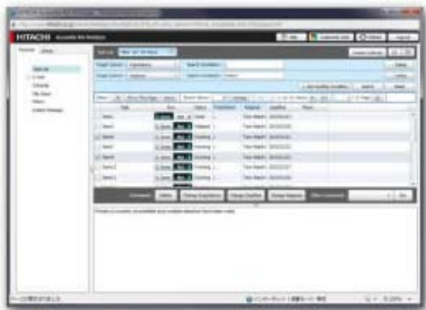
(1) Activities to promote RIA accessibility