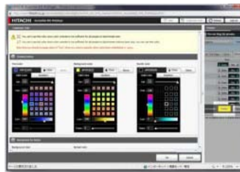
(2) Color adjuster