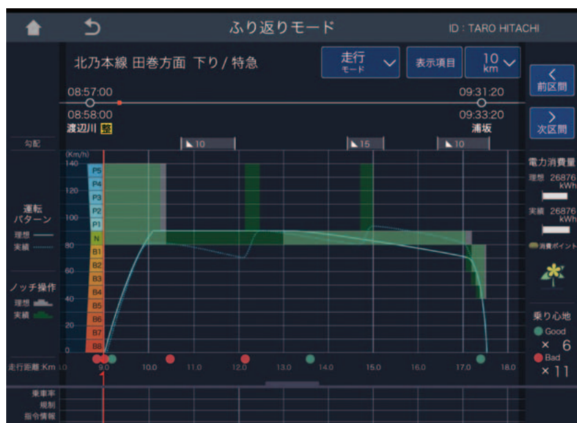
3 Driving performance review screen

It can also compare their performance against an optimal energy-efficient speed profile obtained using an integrated railway simulator. Whereas driver training has been done verbally in the past, this use of visual data to show drivers where and how they can improve should enable a more effective transfer of driving skills.