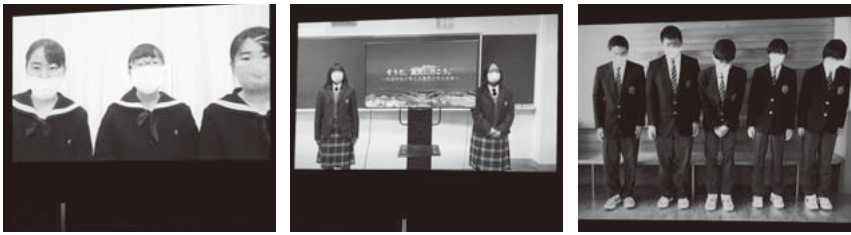
Students from Sapporo Keisei High School, Okushiri High School, and Honbetsu High School showing their presentation videos