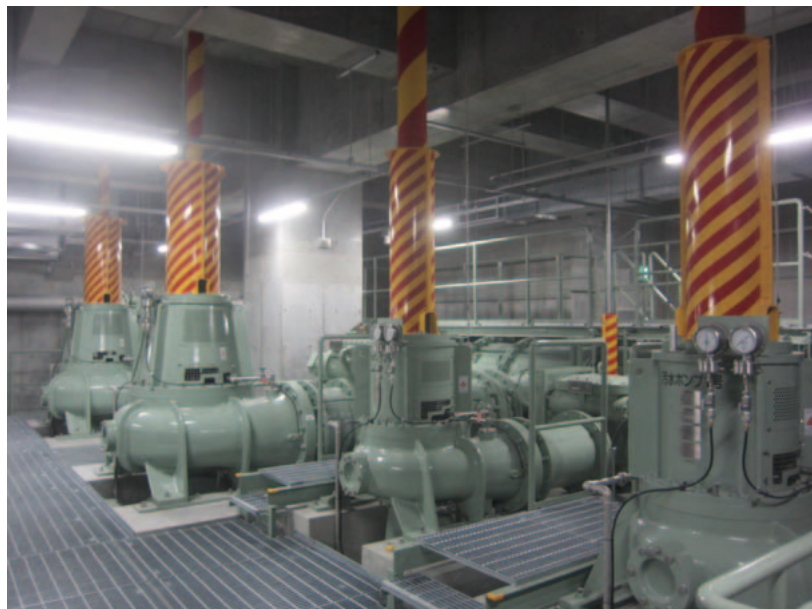
2 Zenigamecho Pumping Station pump room

(2) To supply water over a long distance to a remote water reclamation center, a flywheel was installed as a water hammer countermeasure.