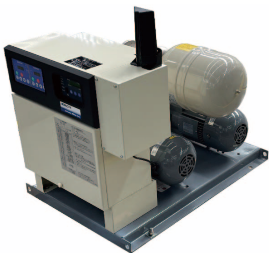
4 Water supply pump unit with IoT support

Moreover, the operating time, number of starts, maximum current value, and failure status can be checked as part of maintenance management. It has a feature that automatically notifies the user when the recommended maintenance period has been reached based on the operating time of each component. Displaying the current operation time with respect to the recommended time for parts replacement makes it easier to recognize when it is time for replacement and enables systematic maintenance. (Hitachi Industrial Equipment Systems Co., Ltd.)