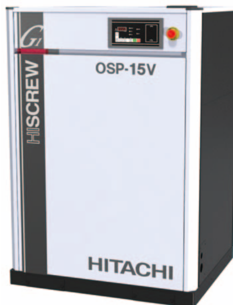
5 New oil-flooded rotary screw air compressor 11/15 kW air cooler

(Hitachi Industrial Equipment Systems Co., Ltd.)