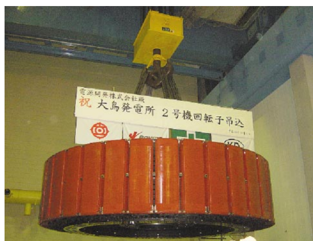
Fig. 6—Site Assembly of Rotor for Unit No. 2. This shows the process for hanging the rotor of the generator. The rotating silicon rectifier is contained within the rotor.

The stator coil using F-class pre-impregnated insulation, offered durability as well as reducing the quantity of varnish used during manufacture. The slots consisted of top-ripple springs and side-ripple springs to ensure a long life for the coil support inside the slots.