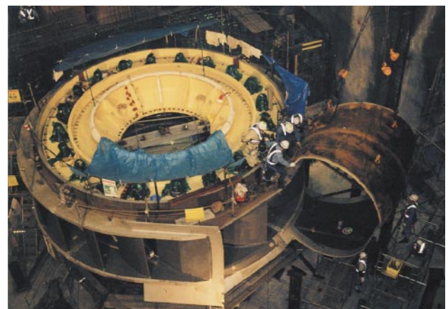
Fig. 5—Site Assembly of Stay-ring for Unit No. 2. This shows the casing plates being attached to the stay-ring, which was assembled into a single unit on site. The stay-vanes were placed at unequal intervals.