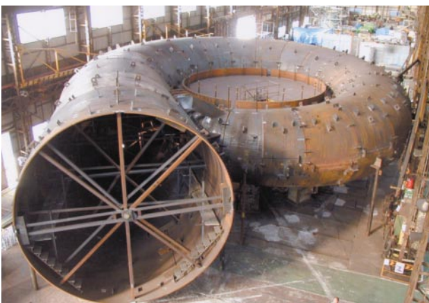
Fig. 4—Shop Assembly of Casing for Unit No. 2. Large-scale casing — the inlet diameter of 6,800 mm, with a maximum outer diameter of approximate 20 m. The casing was divided into several parts and welded together on site.

The strength of the main unit was calculated with 3D finite element analyses. As a result, we adopted a single thick-plate structure for the head cover. Self-lubricated bearings were used in the sliding areas of the wicket gates.