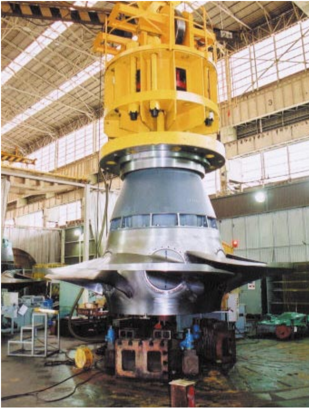
Fig. 3—Final Test to Confirm Assembly of Runner for Unit No. 2 in Workshop.

performance through model tests. The design, manufacture, and inspection of the prototype runner were consolidated based on the 3D-CAD data, which made quality control during each process easier, and