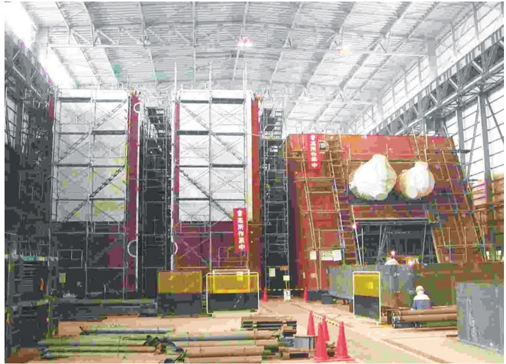
Fig. 3—Condenser Lower and Upper Blocks under Construction. The shop building measuring 32-m across was fully utilized. Lower (left) and upper (right) shells are arranged side by side, and the three sections of the condenser were implemented in a total of nine blocks.

weight of 330 t when the suspension rigging is included).