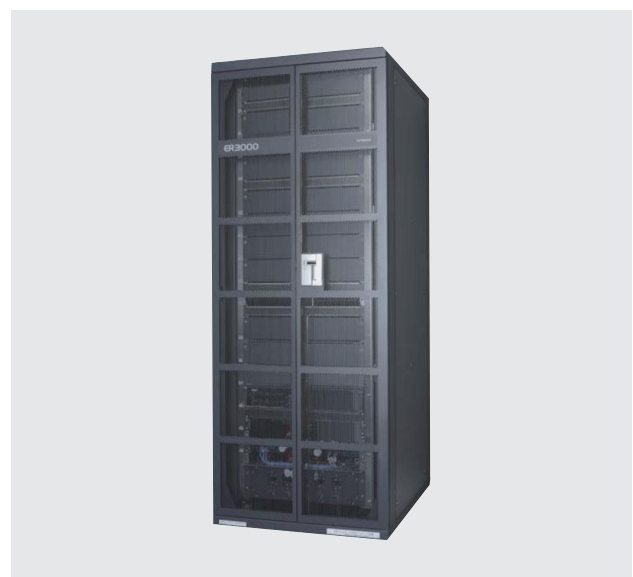
Fig. 3— ASN-GW for Mobile WiMAX. Can be reconfigured flexibly depending on the traffic.

Based on its past experience in development for CDMA2000 1xEV-DO Revision A, Hitachi Group has worked on the development of an ASN-GW and MCBCS (multicast and broadcast services)