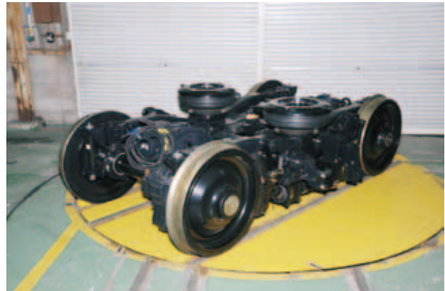
Fig. 9—Lightweight Inner Frame Bogie. A lightweight and compact design was achieved in which all components of the bogie are inside the plane of the wheels.

Technical Specifications for Interoperability (CR-TSI). Although this covers a wide range of areas, carbodies must comply with the structural standards related to static strength and the crashworthiness of the structure.