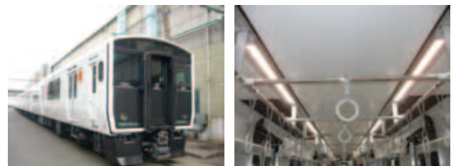
Fig. 1—Series 817 Rolling Stock Supplied to Kyushu Railway Company and its Interior LED Lighting.

In response to the need for energy savings that has arisen in recent years, Hitachi has developed and commercialized light-emitting diode (LED) interior lighting for rolling stock. When used for indirect