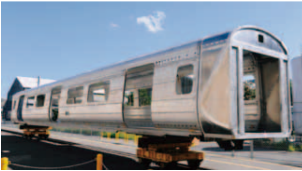
Fig. 8—Carbody. The carbody has a lightweight aluminum structure that complies with CR-TSI.