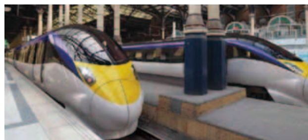
Fig. 6—AT-300 Trains.

The development of the Global A-train includes compliance with the European Conventional Rail