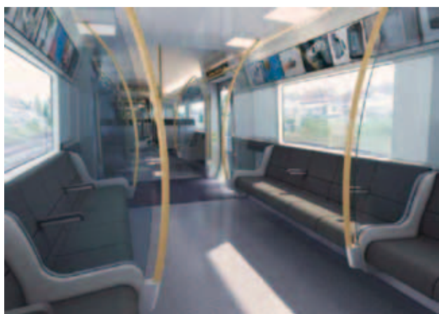
Fig. 4—AT-100 Interior.

The AT-200 is intended for longer suburban services and like the AT-100, has a maximum operating speed of 160 km/h. Features include transverse seating, luggage space, and tables. With two doors per side, the AT-200 only needs a dwell time of