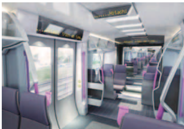
Fig. 5—AT-200 Interior.

Intended for commuter services, the interior combines both longitudinal and transverse seating.