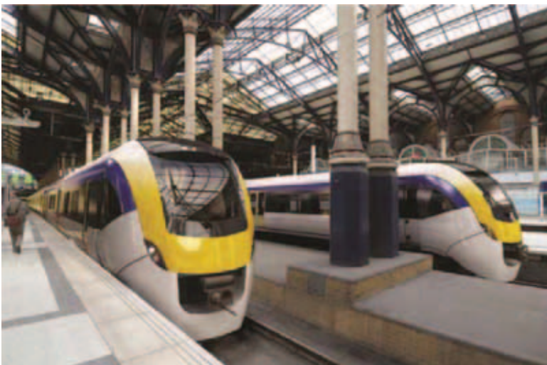
Fig. 3—AT-100 Trains. These trains feature a crashworthy structure that complies with the European Conventional Rail Technical Specifications for Interoperability (CR-TSI) standards.

Global A-train development aims to achieve both maximum compliance with standards and flexibility of car configuration so that customers can enjoy the diverse advantages of selecting Hitachi rolling stock. Hitachi has built the AT-100, AT-200, and AT-300 platforms (where “AT” stands for A-train)