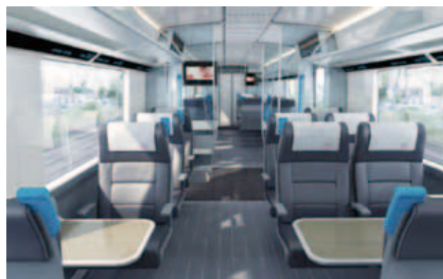
Fig. 7—AT-300 Interior.

The AT-300 has the same front-end shape as the Class 395.