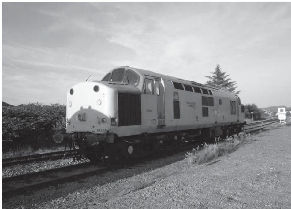
Fig. 4—Class 97 Locomotive This shows the Class 97301 diesel locomotive at Porthmadog.

trial ETCS on-board equipment in the UK. During this project, a Class 97 locomotive (97301) was successfully retro-fitted with Hitachi's on-board system to prove interoperability with other systems currently in use. As part of this recent success, the Hitachi system was correctly identified by the Network Rail Signalling System and Control Centre in Wales (Machynlleth) without any system failures. The locomotive was driven under its own power using ETCS Level 2 and communicating via the GSM-R radio network in various operational modes. The trial was completed in September 2013, running more than 1,200 km without any major failures (See Fig. 4).