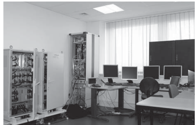
Fig. 3—Functional Lab Testing

Following the completion of TSI compliant testing, the Hitachi on-board ETCS solution has successfully connected to the Network Rail Cambrian Line signalling system and achieved ETCS Level 2 operation. This achievement came as part of Hitachi Rail Europe's 'Verification-Train 3' project to