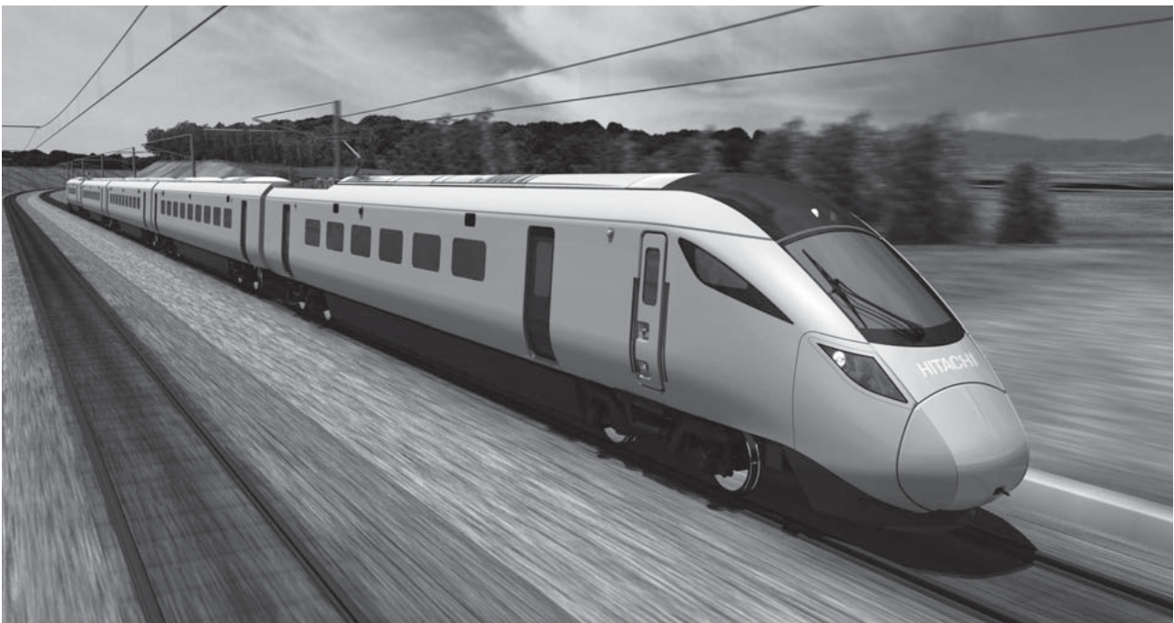
Fig. 1—IEP rolling stock This is a computer graphic of Hitachi's IEP rolling stock for the UK

reliability figures, the biggest rolling stock contract in UK railway history has been awarded to Hitachi; known as the Intercity Express Programme (IEP), including rolling stock delivery as well as maintenance (see Fig. 1). These achievements drive Hitachi's growth in transportation systems on a global scale.