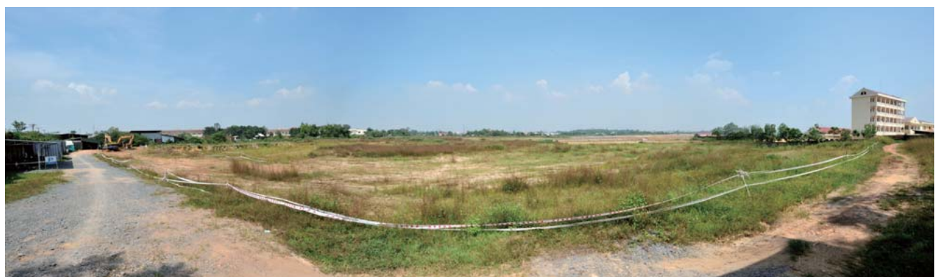
Planned site for rolling stock depot. In addition to the equipment at the depot, Hitachi also has a five-year maintenance contract.