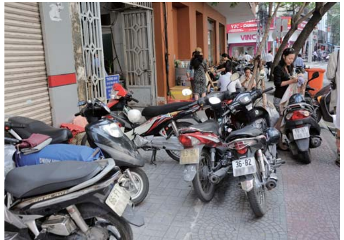
Motorbikes are a vital means of transportation for the residents of Ho Chi Minh City.

The underground section of Ho Chi Minh City Urban Railway Line 1 runs from Ben Thanh to the Opera House and Ba Son stations. The overground section runs through major districts along a main highway, including suburban residential areas, industrial precincts, and a theme park at Suoi Tien, terminating after a total distance of 19.7 km at Suoi Tien.