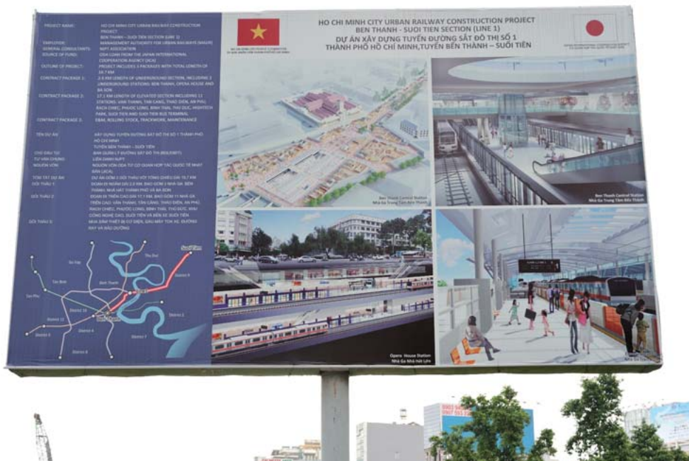
Planned site for station construction near Ben Thanh market. The image of the completed underground station is inspiring the expectations of city residents.

Just as the flow of blood supplies animals' bodies with nutrients, the free movement of people brings dynamism to a city. Railways and other transportation systems act as a city's arteries. Clearly, Ho Chi Minh City Line 1 will not only provide residents with a safe and convenient means of transportation, it will also provide the foundations for the city's further development.