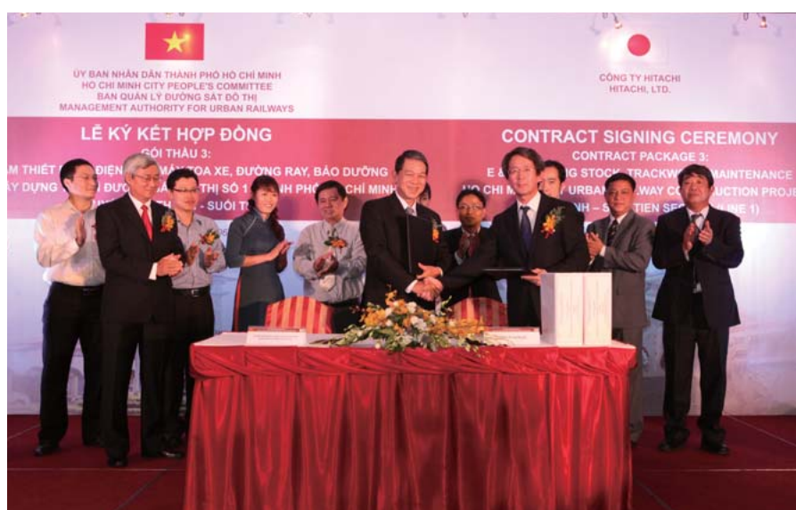
After being awarded preferred bidder status in January 2013, Hitachi signed the formal contract in June of that year.