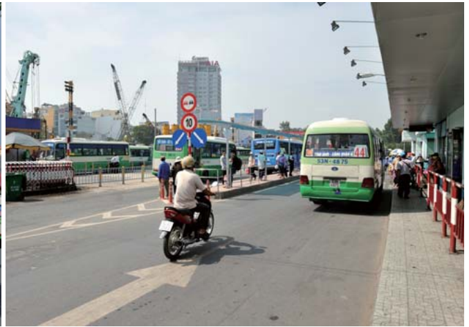
Ben Thanh, home to the city's largest market, and adjacent bus terminal. The new metro station will be constructed at this site.