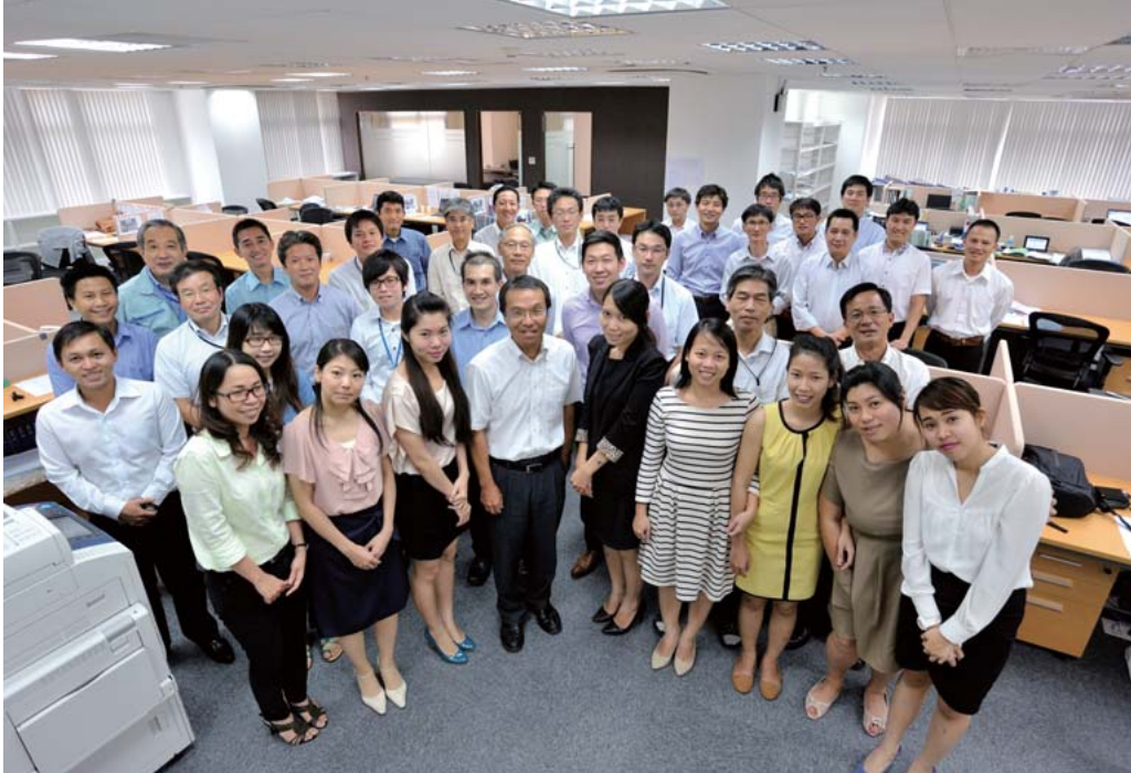
Ho Chi Minh City Urban Railway Line 1 Project Office staff. An organization was put in place from an early stage.

December 2010. Four Japanese groups participated in the tender, with Hitachi forming a consortium that includes the Rail Systems Company of Hitachi, Ltd. and Hitachi Plant Technologies, Ltd. (now the Infrastructure Systems Company of Hitachi, Ltd.).